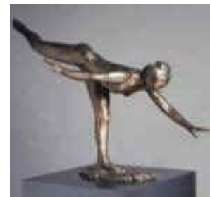
Grand Arabesque, Third Time