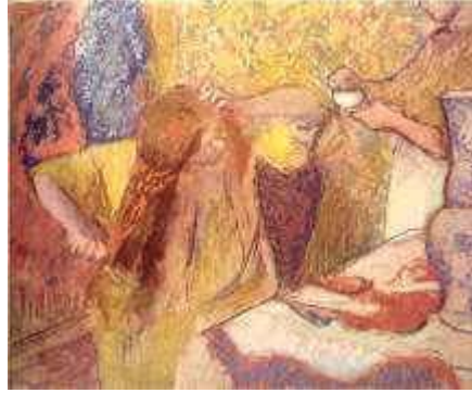
Woman Washing Her Hair

Now, at the Art Gallery of Ontario (AGO), those who want to gain a greater insight into this unknown talent possessed by Degas can delve into his three-dimensional work; they can even sit down to draw his sculptures without feeling that they are intruding. Degas Sculptures from the Ny Carlsberg Glyptotek , Copenhagen, which is on view until January 4, 2004, invites such intimate perusal of the artist's work. These figures, all cast in bronze after his death in 1917, are one of only four complete sets of his sculptures in existence. The exhibit is augmented by a small collection from the AGO of works by Degas on paper and canvas. They serve to illuminate the period in which the undated sculptures may have been created.