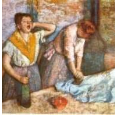
Edgar Degas, Washerwomen