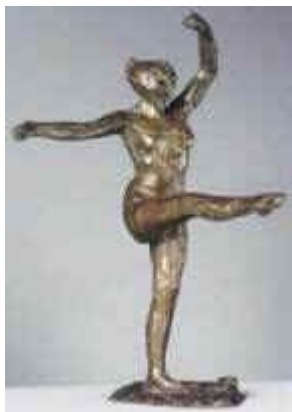
Dancer, Fourth Position Front, on Left Leg

Degas is quoted as saying that he turned to sculpture to give his paintings and drawings "greater expression, greater ardour, and more life." Although Pierre-Auguste Renoir declared that Degas was "the greatest living sculptor", Degas obviously saw his little wax and clay pieces as a mere adjunct to his work. In this exhibit one can see him groping toward understanding of the female body in various poses, nude and dressed. Then there is his obvious love for horses. He was concerned with the complexity of movement and each horse in this display shows how he attacks the problem of placing a three-dimensional object into space to make the onlooker feel the power of movement.