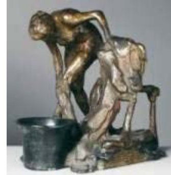
Woman Washing Her Left Leg

While the 73 bronzes from the Danish museum, plus three from the AGO give one a glimpse of what Degas tried to achieve with his wax sculptures, the show lacks a certain oomph. Although displayed in seven different rooms according to subject, whether it be his bathing women, the dancers or the horses, after a while all that bronze begins to pale. The few drawings and paintings that the AGO added help to infuse a little spark, but one wishes for more. Still, it is an experience to view Degas from this perspective.