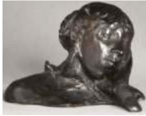
Woman resting Head on One Hand, Bust